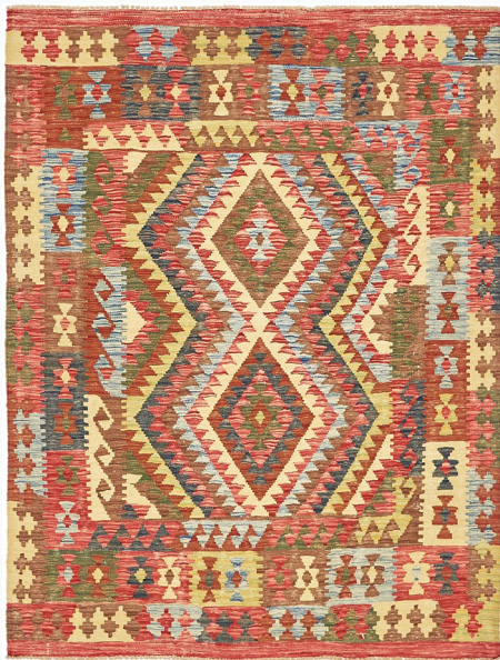
Kilim Maymana SKU# 2306850