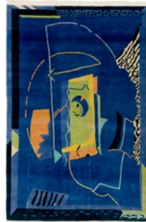
Nepal Collection SKU #2478213

Visit uniqueloom.com & explore over 70,000 unique hand knotted rugs.