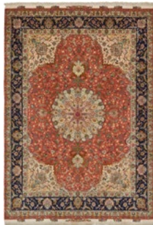
Tabriz Collection SKU #10904096