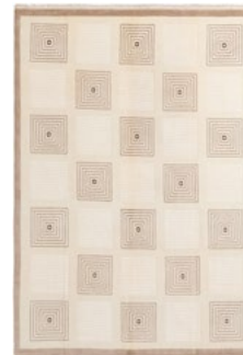
Darya Collection SKU #2712286