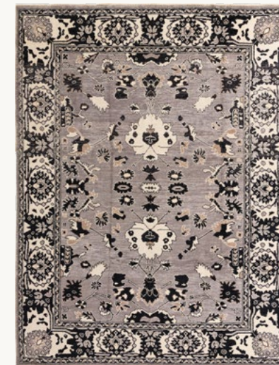
Oushak SKU #2670611

Muted pastels blend seamlessly with the intricate, tribal designs of our Oushak Collection. The soft color palette is created by foraging local vegetation, making this collection 100% vegetable dyed.