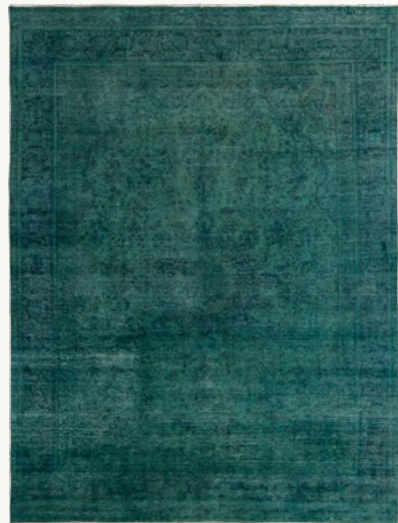
Ultra Vintage SKU #2640765