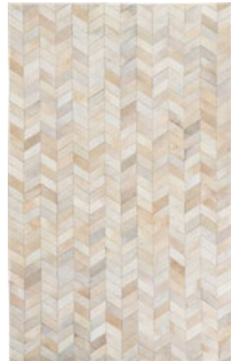
Cowhide Collection SKU #2739809

Visit uniqueloom.com & explore over 70,000 unique hand knotted rugs.