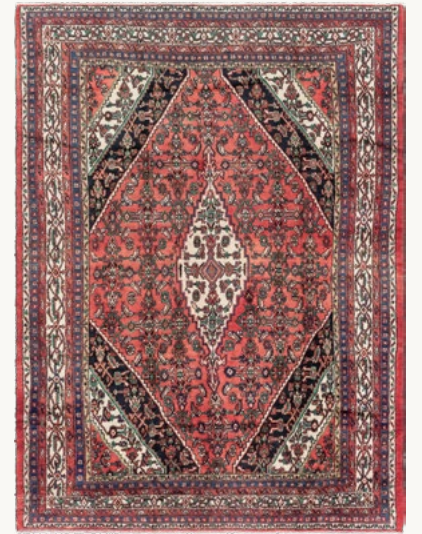
Hamedan SKU #2495817