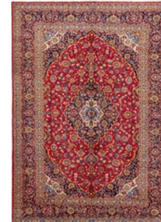
Kashan Collection SKU #10916118