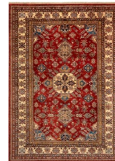
Kazak Collection SKU #10937180