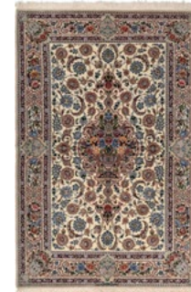
Isfahan Collection SKU #10939533